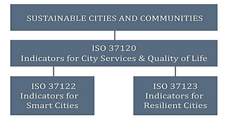
Figure 4: ISO Standard of Indicators for Smart and Sustainable Cities [29].

The ISO 37120 standard, together with 37122 and 37123, provide a framework for Smart and Sustainable Cities (see Fig. 4). This ISO standard does not care whether the city is Smart or otherwise and proposes a step-by-step process to identify ICT-related initiatives for each of the ISO 37120 indicators. The result is the list of initiatives that can be applicable for the city manager to move the city to the next better level [29].